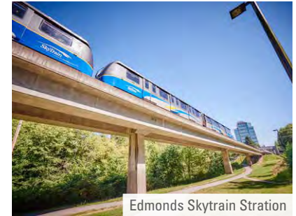
Edmonds Skytrain Station