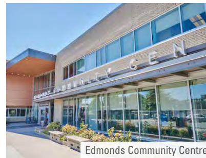
Edmonds Community Centre